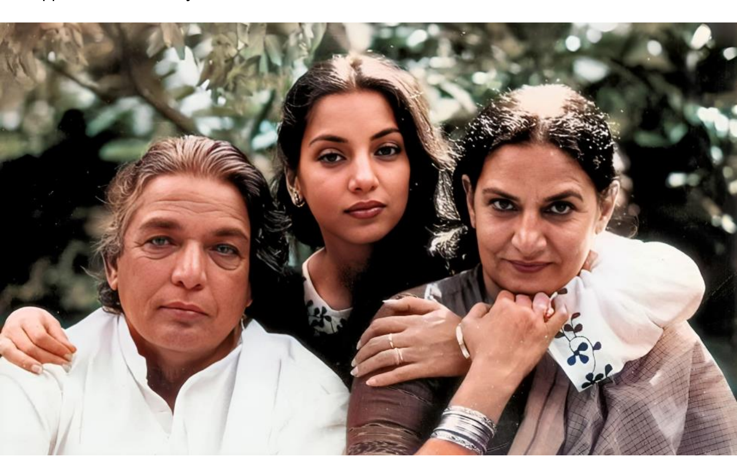
Kaifi Azmi and Shaukat Azmi, Shabana Azmi in middle

The vibrant celebration of the Annual Function echoes Kaifi Azmi's vision, creating an environment where knowledge knows no bounds, versatility is celebrated, and opportunities are truly unlimited.