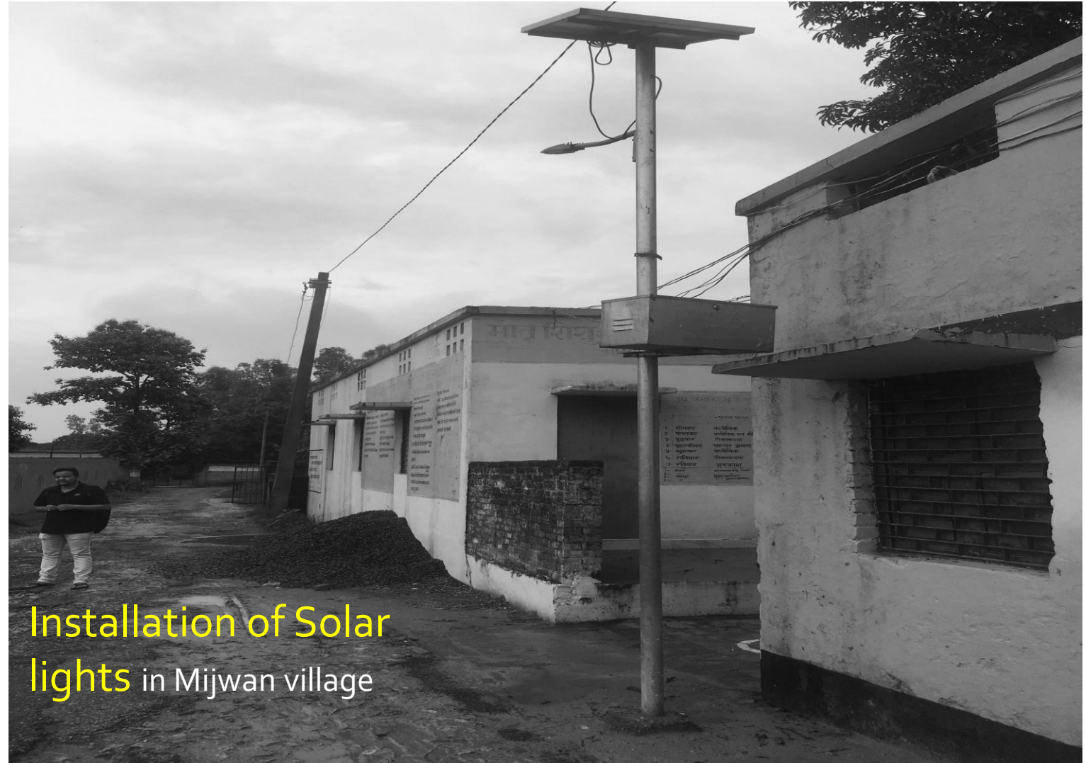
Installation of Solar lights in Mijwan village